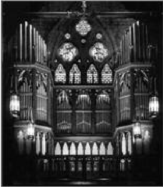
The First Presbyterian Church in Philadelphia 201 S. 21st Street (at Walnut Street) www.fpcphila.org 215-567-0532